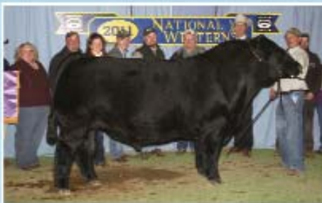
BWL HARD CORE

$40,000 female that sold to Hearthstone & Bumgardner, South Vienna, Ohio