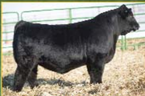
Felt Johnny Cash 13C

Sire: CCR Cowboy Cul B048Z, Dam: KENCO Miley Cottontail BW: 82#, WW: 658#