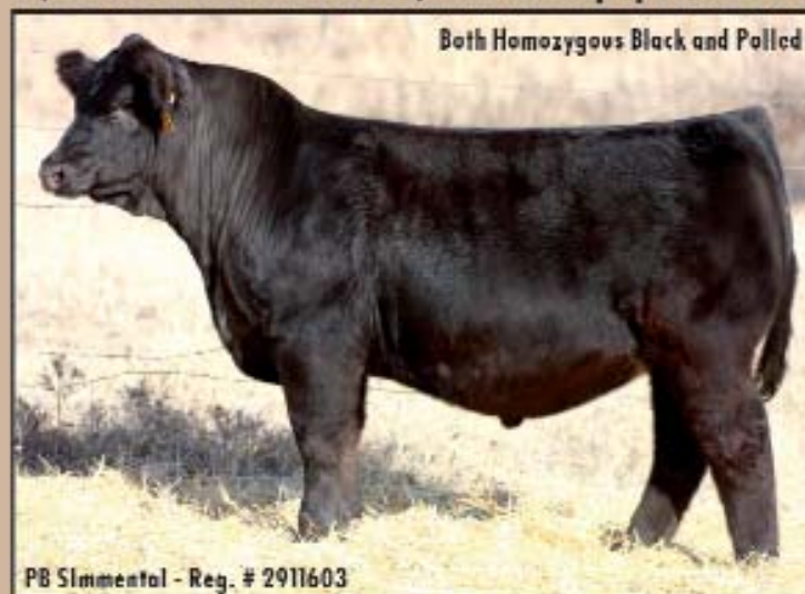
Both Homozygous Black and Polled