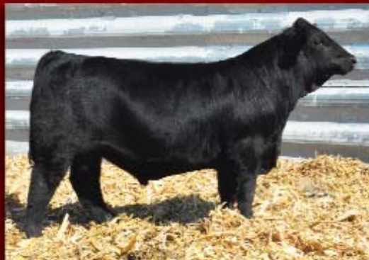
C903 • Jan. 1/2 blood

Turning Point x Dew It Right x Magnificent Lady