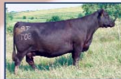
AR Ideal 345 854# 807