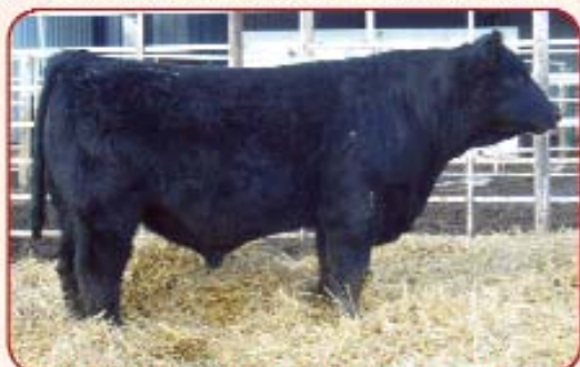
FF WHEELMAN BEAR C528

DOB: 2/12/15 • ¾ SM ¼ AN • by EXAR Upshot EPD's: CE 13.2, BW 1.6, WW 70.1, YW 110.9, MCE 9.3, MM 17.8, MW 52.8, MARB 0.51, REA 0.78, API $134.8, TI $75.6