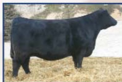
June (OCC Juanada 673N)