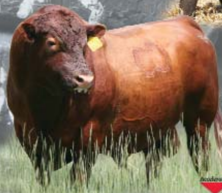
Schuler Rebel 0029X (AR) Other Red Angus sires: Schuler Rogue A669 FHG Lacy Legacy 6097