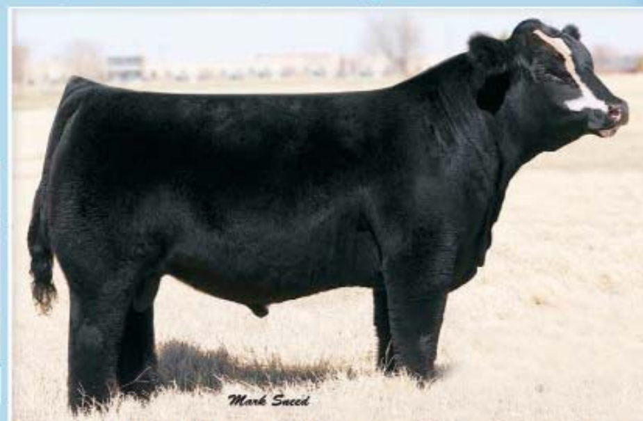
WS A STEP UP X27

This year's offering will feature progeny from LLSF Uprising, W/C Lock Down, TNGI Grand Fortune, Mr NLC Upgrade & W/C BF Innocent Man