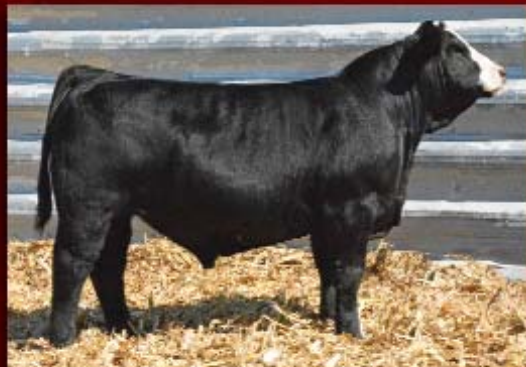
C491 • Feb. PB

Turning Point x Dew It Right x Magnificent Lady