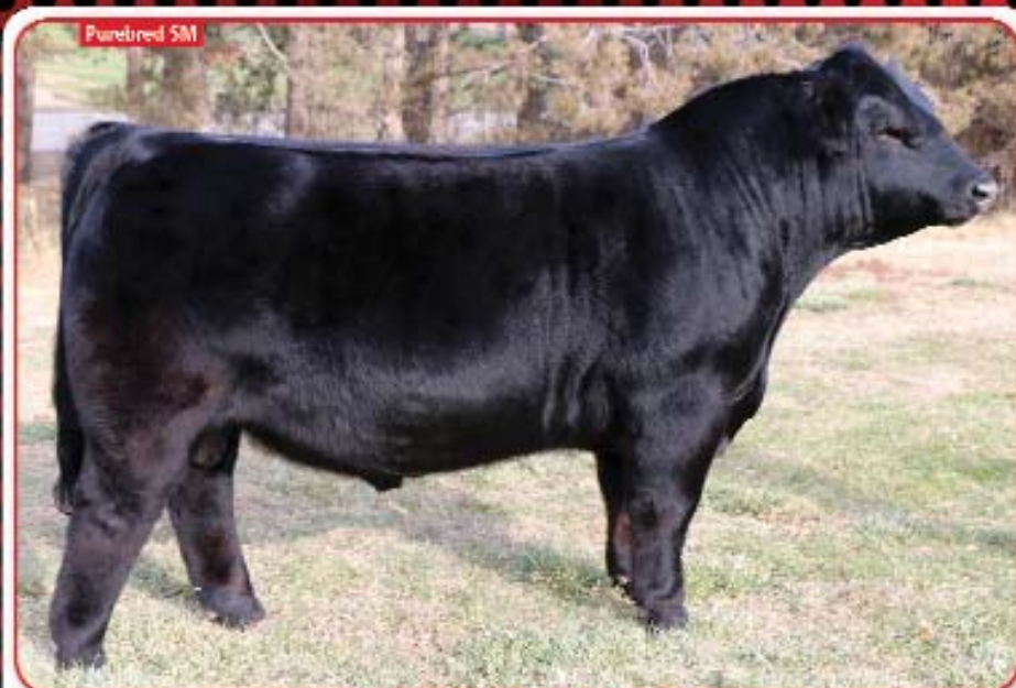
LHT Making Tracks 03C W/C Wide Track 694Y x SVF Steel Force 5701 BW 2.5 WW 70 YW 107 API 144 TI 71

Sunday February 21st 12:00 Noon Beatrice 77 Livestock • Beatrice, Nebraska