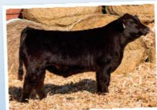
Catalyst x Ranch Hand March polled purebred