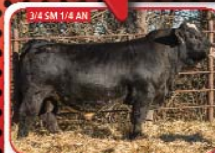
LHT Mr Upgrade 298B Mr NLC Upgrade U8676 x OCC Legend 616L BW 1.1 WW 72 YW 112 API 127 TI 77