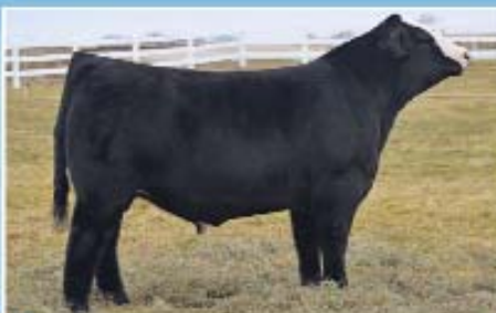
WS REVOLUTION C6

2011 Denver Champion Bull out of a Walsh bred cow