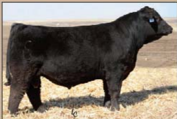
CCR Cowboy Cut - 21 Sons + 10 Daughters Sell!