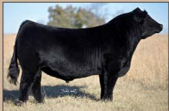
LLSF Pays to Believe ZU194 - The 'Prepotent' Champion!