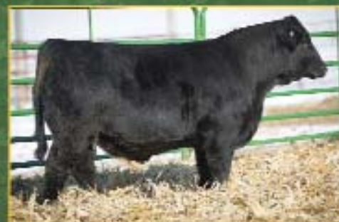
Felt Got Game 40C

Sire: Harkers Johnny Ringo Dam: WCS Ms. Broadside 2022Z BW: 83#, WW: 762#