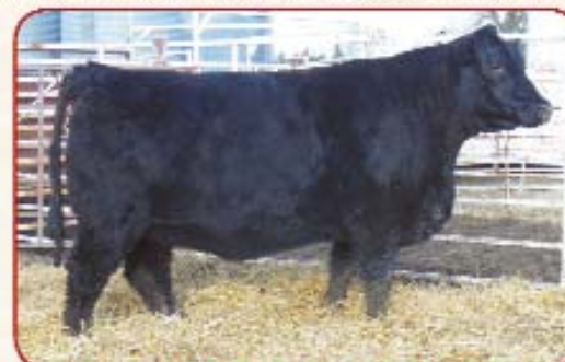
FF MS PARAMOUNT B946

DOB: 3/6/15 • ½ SM ½ AN • by FELT Purple Steps Up EPD's: CE 5.9, BW 1.8, WW 77.7, YW 116.4, MCE 9.1, MM 24.3, MW 63.1, MARB 0.32, REA 0.69, API $114.5, TI $75.4