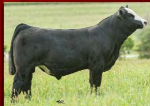
06C • Jan. PB