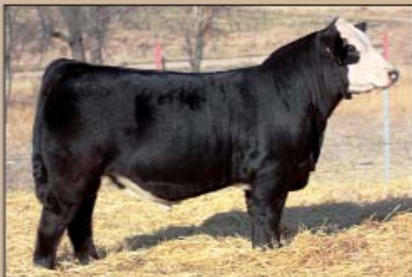
W/C Loaded Up - 20 Sons + 10 Daughters Sell!