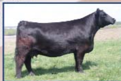
KATCF Independence S30L

Built Right One Eyed Jack Uprising • Upgrade Broker • Steel Force Dream Catcher Beefmaker Combustible • Wide Track Lookout • Insight Final Answer Style & MORE!