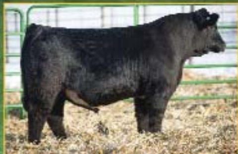
Felt Miley Cottontail 23C