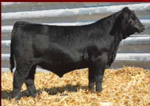
C23 • Jan. PB