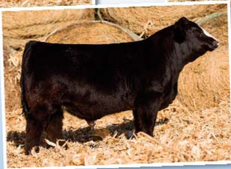
Uprising x SVH/NJC Jewel S306 (Dream On) March polled purebred