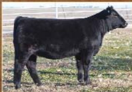
BF TROPICAL SNOW April Show Heifer

An outstanding 3/4 blood Show Heifer by Innocent Man x Tango