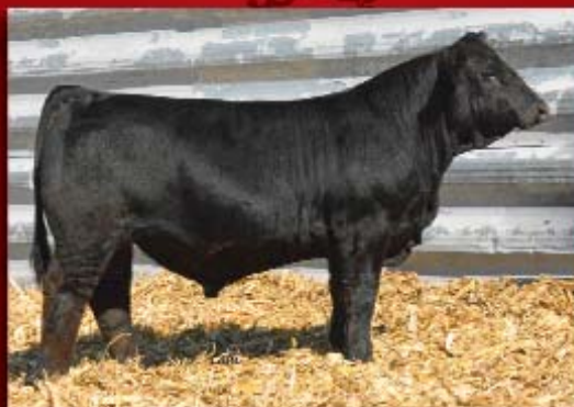
C12 • Jan. PB