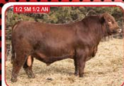
LHT Mr Conquest 255B HXC Conquest 4405P x CNS Dream On L186 BW -1.8 WW 54 YW 80 API 137 TI 67