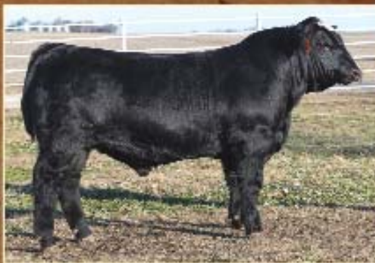
THE ACCUSED For Sale