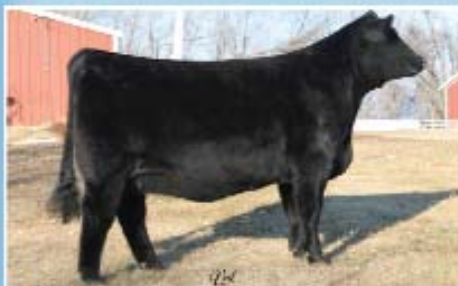
WS JOY'S DELIGHT X40

$160,000 bull purchased by C-Mor Beef, Blackford Show Cattle, Bar Q H Farms & JS Simmentals