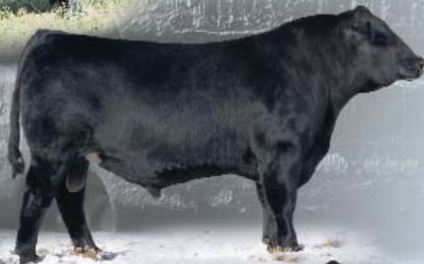
Lazy TV Watchman W021 (GV/BA) Other Gelbvieh/Balancer sires: Flying H Professor 22W BGGR Gravity 803A Butlers Red Oak 908W