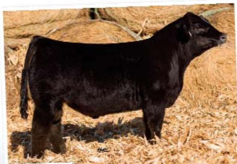
I loads Up 20X x Mainline March polled 50% SimAngus