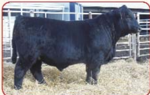
FF FINAL PRODUCT C1023

SELLING: 85 Bulls (Simmental/Simm/Angus) All Bulls sell with a First Season Breeding Guarantee. 50 Bred Females (Bred to Top Calving Ease Bulls) • 35 Fancy Open Heifers