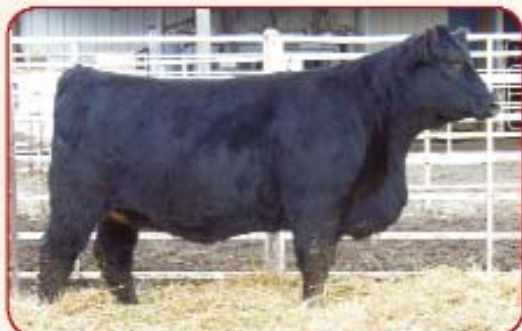
FF MS SHOOTER B503

DOB: 2/9/14 • ½ SM ¾ AN ¼ MX • by GW Paramount EPD's: CE 12, BW 0.8, WW 64.7, YW 104.6, MCE 9.5, MM 24.3, MW 58.7, MARB 0.73, REA 0.69, API $153.8, TI $82