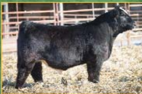
Felt Wheel Man 70C

Sire: LLSF Uprising Z925, Dam: Felt Purple Reigns 717T BW: 82#, WW: 868#