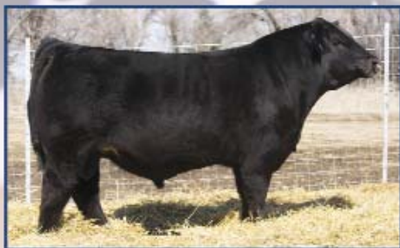
Kappes Mile High B11 ASA#: 2840218

Selling 50 bulls, 35 opens, 35 breds/pairs, and embryo lots