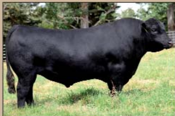
Leachman Prophet J0302 - The Performance Legend!

Selling 80 Powerful Bulls and 100 Highly Maternal Heifers!