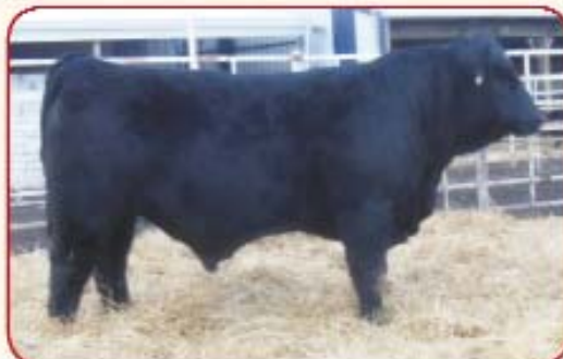
FF COMFORT ZONE C1078

DOB: 2/11/15 • ½ SM ½ AN • by Connealy Final Product EPD's: CE 7.9, BW 0.9, WW 73.9, YW 117.9, MCE 10.7, MM 22.9, MW 59.8, MARB 0.46, REA 0.55, API $129.6, TI $78