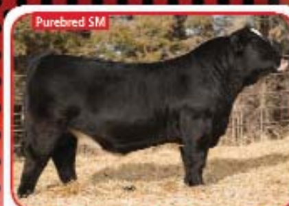
JZ Mr Shocking Force 1C STF Shocking Dream 5114 x SVF/NJC Built Right BW -0.2 WW 61 YW 89 API 138 TI 70