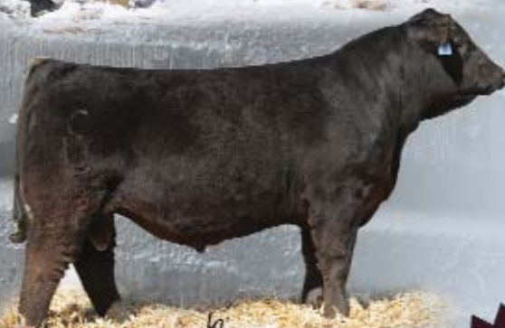
CCR Cowboy Cut 5048Z (SM) Other Simmental sires: Mr. Beef Maker102Y TNT Tanker U263 W/C United 956Y