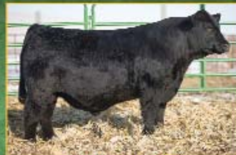
Felt No Hurry 33C

Sire: Harkers Johnny Cash, Dam: RS&T Optimus Prime BW: 83#, WW: 820#