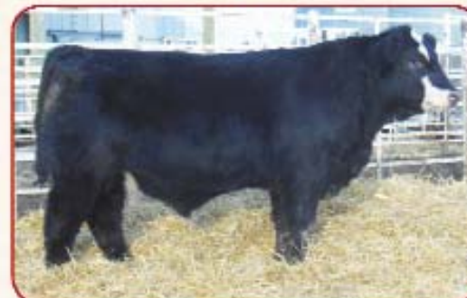
FF UPSHOT C427

DOB: 2/8/15 • ¾ SM ¼ AN • by GW Comfort Zone EPD's: CE 16.9, BW -2.1, WW 70.5, YW 101.8, MCE 11.9, MM 20.9, MW 56.1, MARB 0.29, REA 1.03, API $157.7, TI $77.8