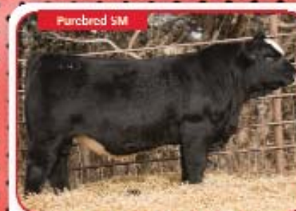
LHT Mr Uprising 01C LLSF Uprising x SVF/NJC Built Right N18 BW 2.8 WW 66 YW 102 API 106 TI 63