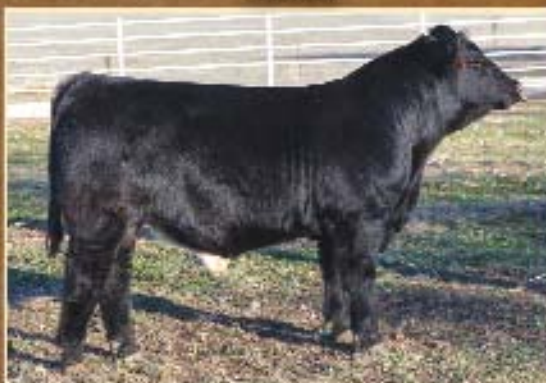
INNOCENT DREAMER For Sale