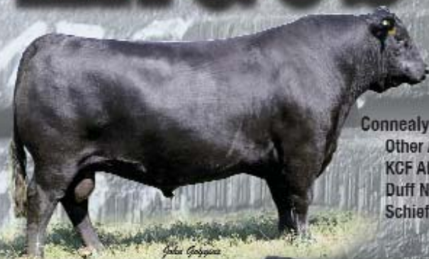
Connealy Consensus (AN) Other Angus sires: KCF Absolute Duff New Edition 6108 Schiefelbein Effective 61