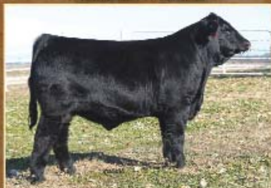
BILLY JOEL For Sale