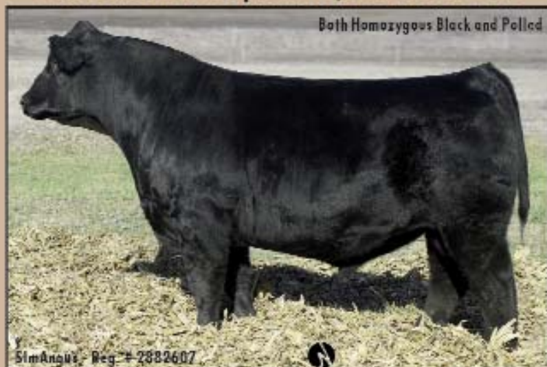
Both Homozygous Black and Polled

CCR Frontier's most powerful, EPD stacked son!