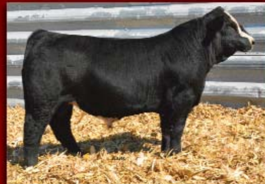
C869 • Jan. 3/4 blood