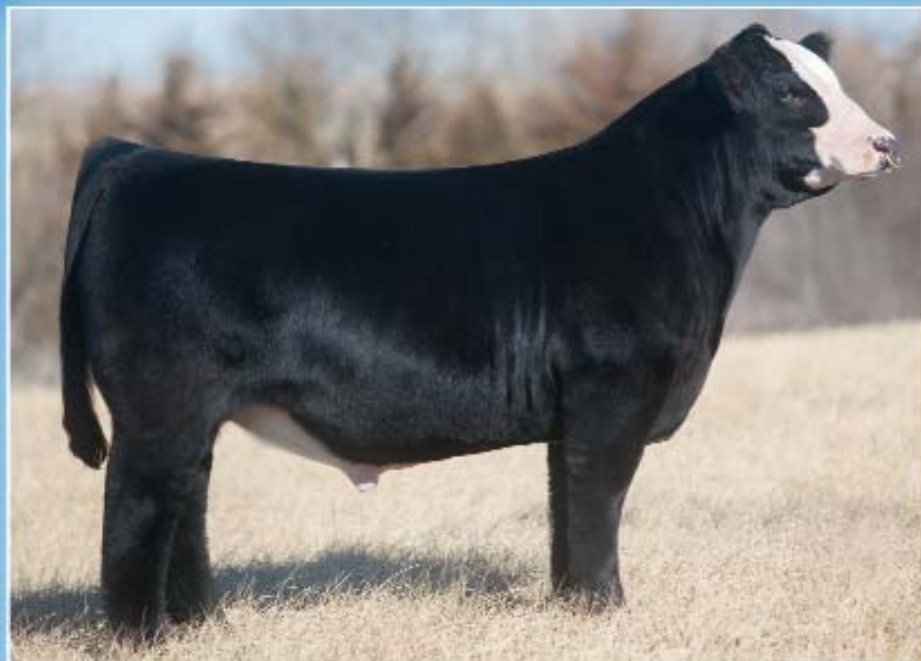
WS REVIVAL B26

Sales starts promptly at 12:00 Noon • Hubbard, Nebraska At the Farm • 1989 Hwy. 35 • Hubbard, NE