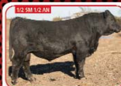
LHT Mr Answer 30C SAV Final Answer 0035 x PVF-BF BF26 Black Joker BW -0.7 WW 67 YW 106 API 136 TI 74

Selling 85 Simmental, SimAngus™ & Angus Herd Bull Prospects Red & Black