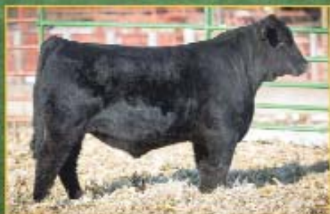
Felt Hiway 20 Ride 691C

Sire: LLSF Uprising Z925, Dam: BWL Ginger 930Y BW: 81#, WW: 757#