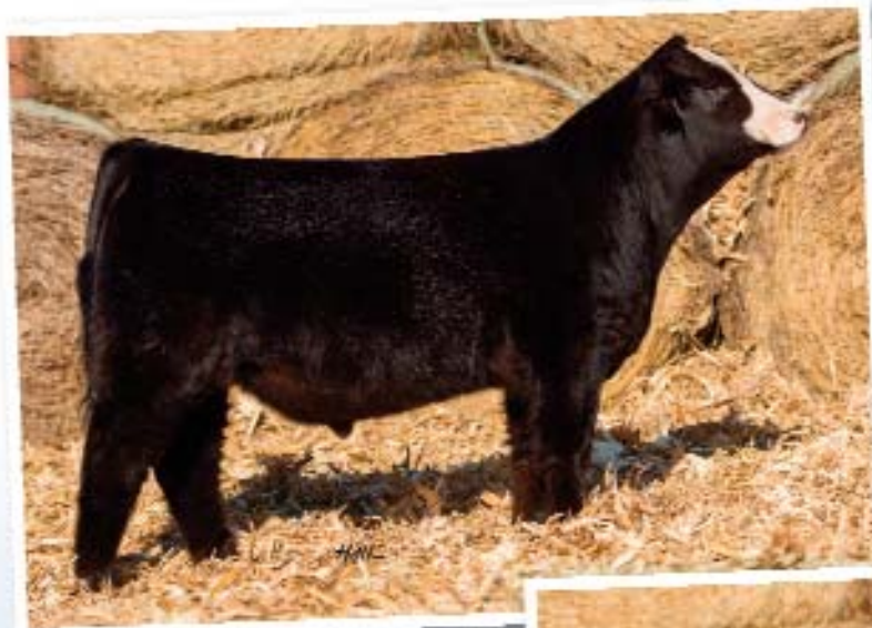
Uprising x Lazy II Burn Baby Burn R34 (WLE Benchmark) March polled purebred The maternal brother to Combustible