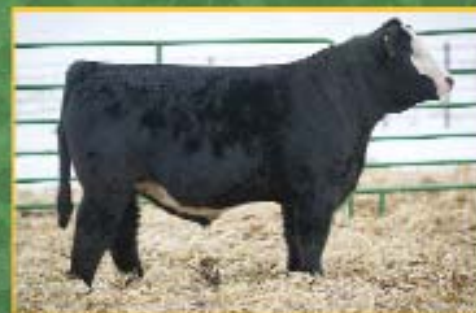
Felt Uprising 660C

Sire: FBFS Wheel Man 649W, Dam: ZKCC Cow 550X BW: 78#, WW: 918#