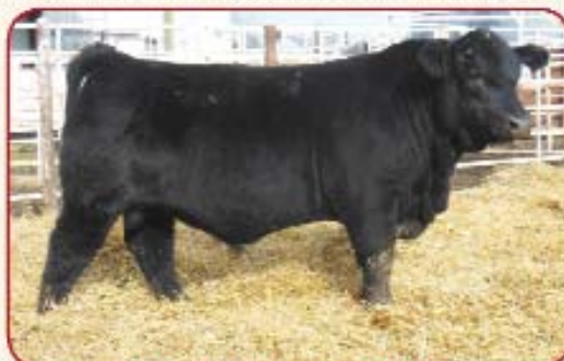
FF STEP UP C941

DOB: 2/19/15 • PB SM • by Wheel Man EPD's: CE 7.5, BW 3.5, WW 64, YW 91.7, MCE 7.6, MM 14.3, MW 46.3, MARB 0.1, REA 0.47, API $111, TI $63.6