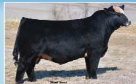
WS STEPPING STONE

LLSF Uprising son selling in the NWSS "The One" 2016 Sale in Denver on January 18th!