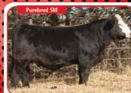
LHT Mr Lock N Load 56C Remington Lock N Load x SVF Steel Force Est BW 1.15 WW 57 YW 96 API 121 TI 62