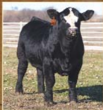
THE JUDGE "Syndicated" • $40/unit

Purchase through Vogler Semen Centre, Cattle Visions Or Bill Fulton-BF Black Simmentals