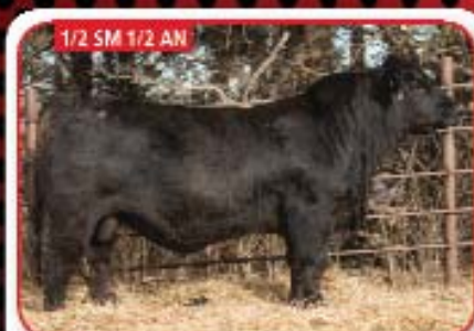
LHT Mr Upgrade 303B Mr NLC Upgrade U8676 x FBF Time Out 767T BW 0.8 WW 78 YW 131 API 131 TI 86