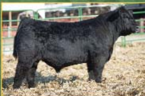
Felt Kick The Dust Up 2022C

Sire: LRS Turning Point 3117A Dam: PEV AND Katinka Gal 69x1 BW: 76#, WW: 691#