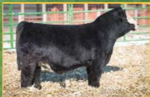
Felt Uprising 51C

Sire: FF Sharper Image Z537, Dam: Lazy H Personality A33 BW: 81#, WW: 848#