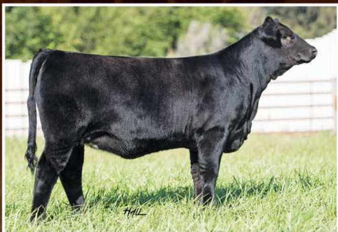
NPC Miss Unis D630