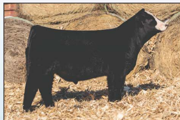
LABEL ME PROUD C016

Thank you to Spencer Farms, IA, for their $12,000 selection.