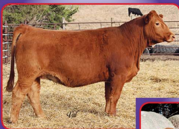
LHT Ms Voltage 27C SS/PRS High Voltage 244X x SAW EMB 110 Topnotch 712 Bred to W/C Lock Down