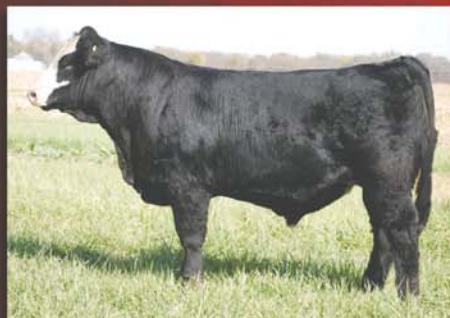
D604 • Purebred STF Royal Affair x T85 Ms Fancy Yardley