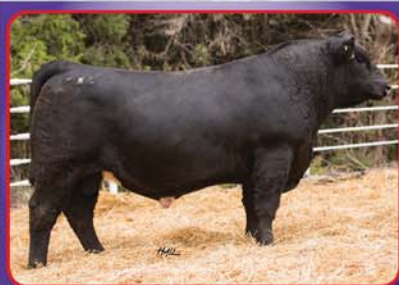
LHT Mr United 133C W/C United x Connealy Packer 547 • SimAngus™ 15 Service Age Bulls Like This Sell December 11th!

These full siblings sell on December 11th!