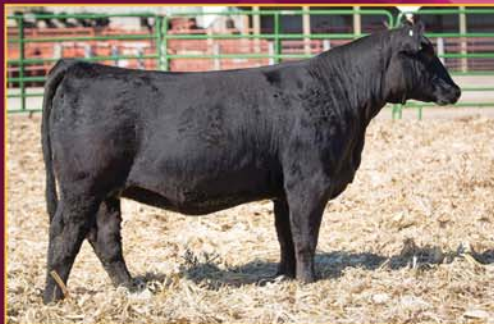
WS MS Fortune C77