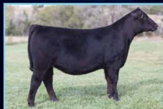
GCC Gold Standard x Guns N Ammo Halfblood