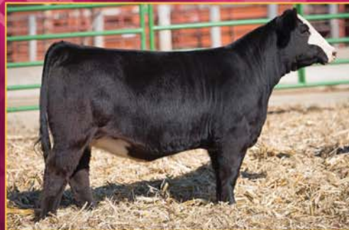
Felt Miley 5D