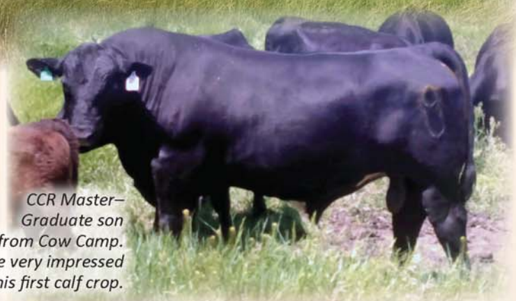
CCR Master— Graduate son from Cow Camp. We are very impressed with his first calf crop.