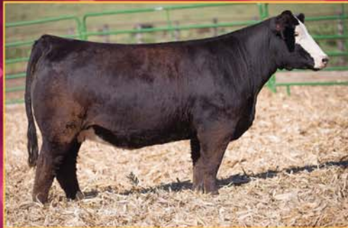
Apex 116 Apex Karma R37C

West Point Livestock Market • West Point, NE