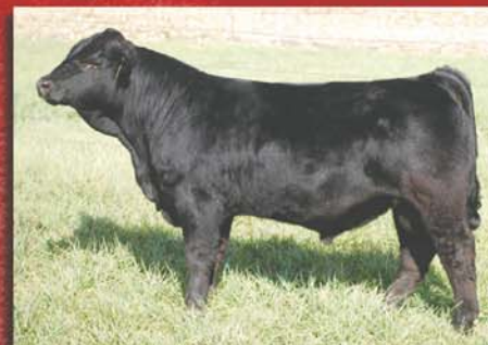
D606 • Purebred Broker x Bernadette 2016 IA State Fair Class Winner