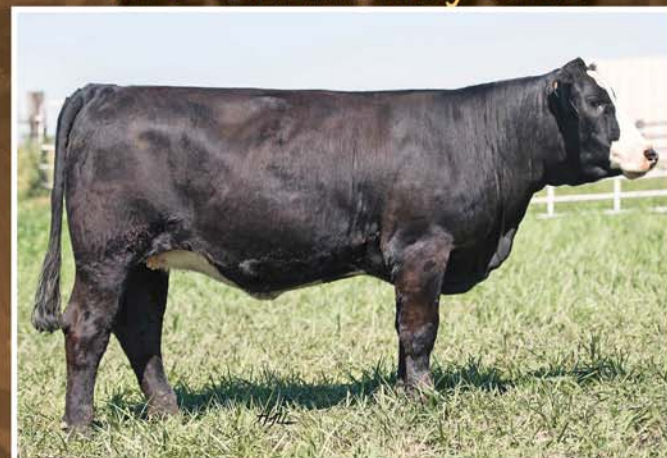
NPC Chillin Away C513