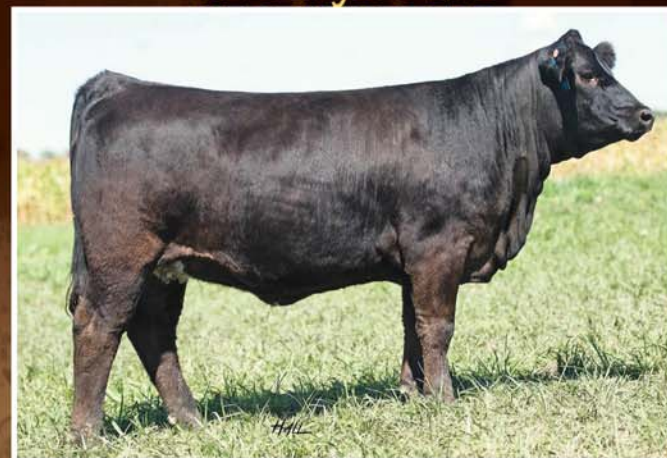
NPC Mya C526