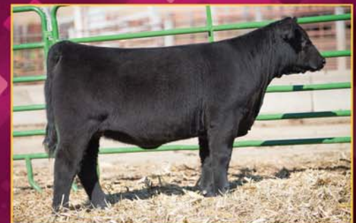
Felt Walk On Water 563D