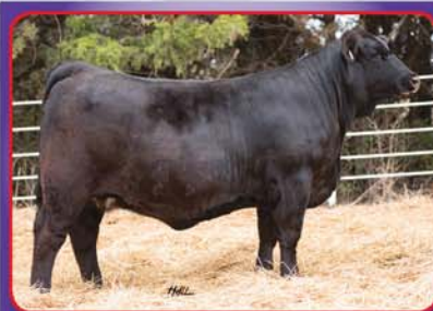
JZ Ms Freedom 07C ASR Augustus Z2165 x JS Sure Bet 4T Bred to KNH Added Value