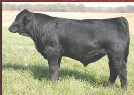
D933 • Purebred Jack Around x Dew It Right