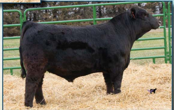
2016 Top Selling Bull