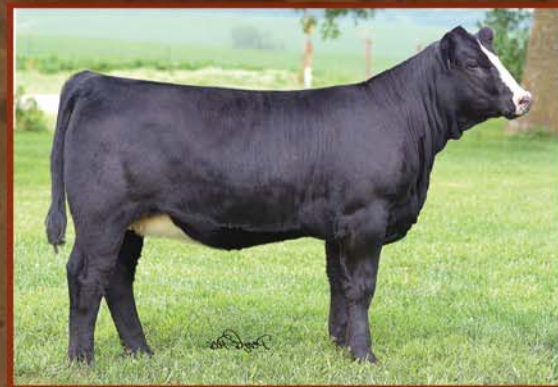
BF Miss Iman Glamour

Top selling open heifers in 2015-2016 Head of the Class Sale.