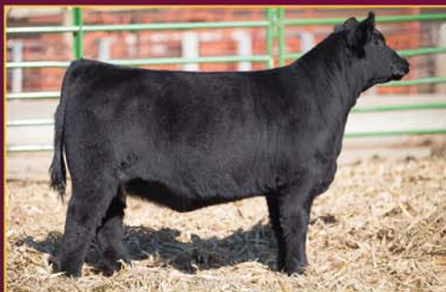
Felt Shaniqua Na Na 350D