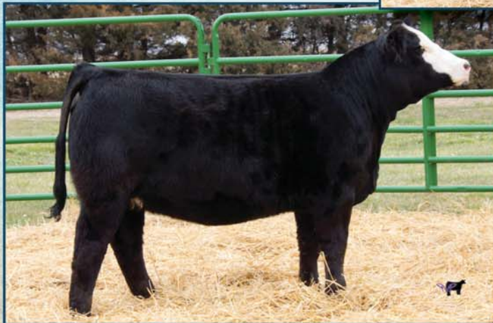
2016 Top Selling Open Heifer