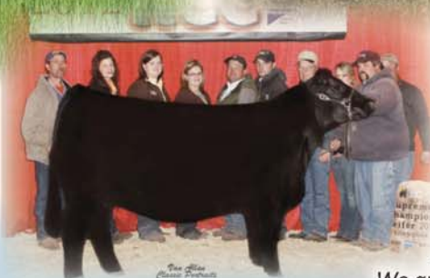
Donor Dam Lady Bear — Supreme Champion at 2012 NCC