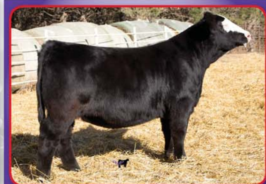
LHT Ms Uprising 122D LLSF Uprising Z925 x Remington Red Label HR February PB Show Heifer

These full siblings sell on December 11th!