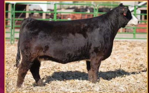
Apex 101 Apex Irish Maid MS681

Birthdate: 3/1/2015 • ½ SM, ¼ AN, ¼ Maine