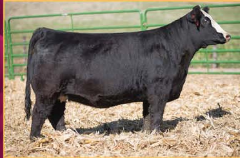
Apex 154 Apex Eve PA732C