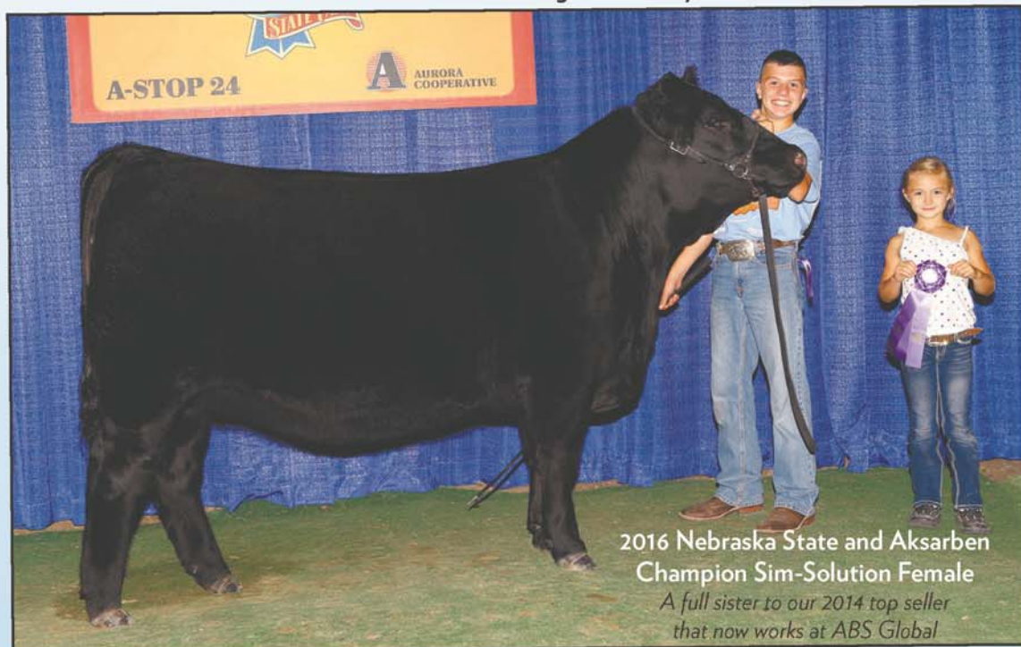
2016 Nebraska State and Aksarben Champion Sim-Solution Female A full sister to our 2014 top seller that now works at ABS Global

Selling 65 Simmental, SimSolution, Angus, and Maine-Anjou Bulls Tested & Guaranteed - Housing & Delivery Available