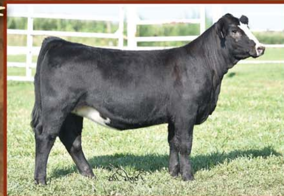
BF My Fair Lady