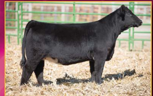
Felt Bright Lights 51D