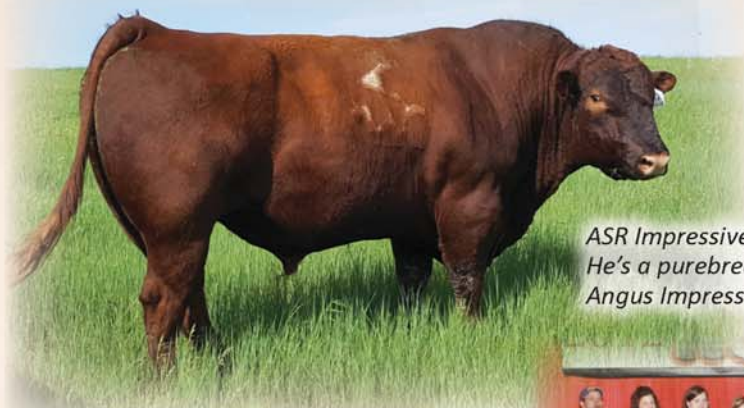
ASR Impressive— He's a purebred Red Angus Impressive son.

Black & Red • Purebreds & Percentages Please inquire if interested.