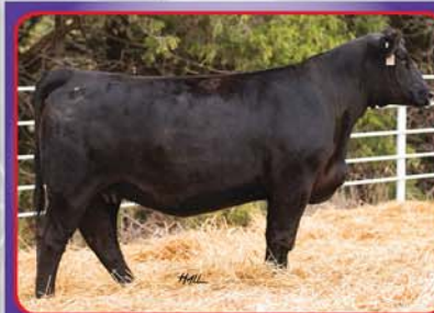
LHT Ms Upgrade 299B Mr NLC Upgrade U8676 x Baldridge Kaboom K243 • Bred to W/C United • SimAngus™