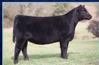
No Remorse x Lookout Halfblood