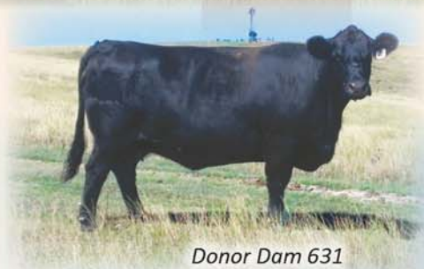
Donor Dam 631