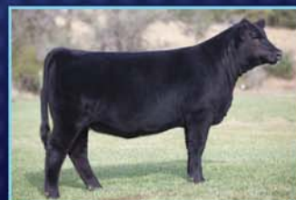
Daddy's Money x Griswold Chopper \frac{1}{4} SM /Maintainer