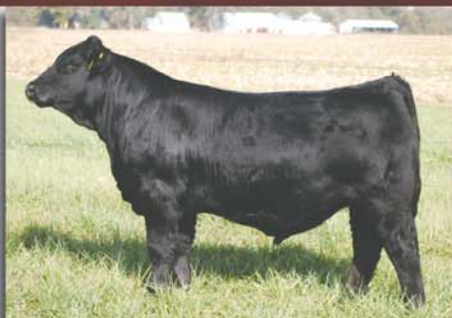
D612 • Purebred Jack Around x T85 2016 IA State Fair Res. Champion