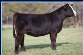
Cowboy Cut x Ammo Y10 Donor • PB Full Sibs