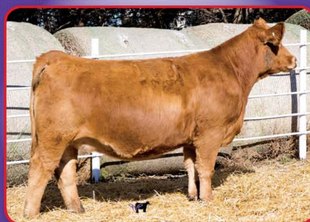
LHT Ms Amigo 268B • GCF Amigo x Wheatland Red Teddy Bred to W/C Executive Order