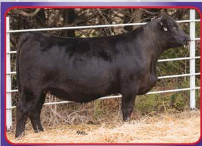
LHT Ms United 23C W/C United x SAV Bismarck 5682 Bred to Hooks Broadway • SimAngus™