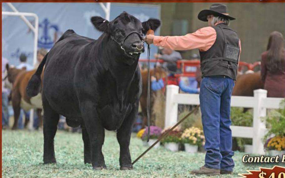
BF Billy Joel