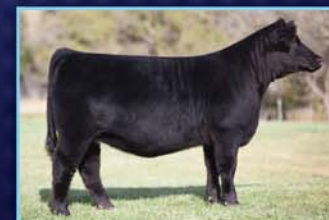
WC Innocent Man x Guns N Ammo Purebred