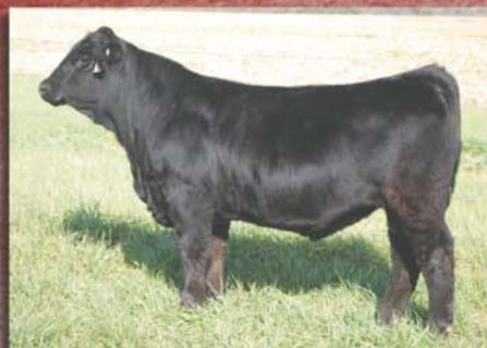
630D • Purebred Uno Mas x Broker 2016 IA State Fair 2nd in Class