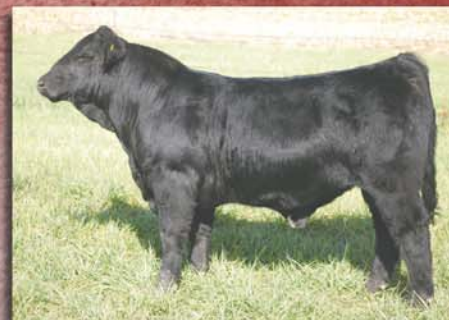
D869 • 3/4 Blood Innocent Man x JS Sure Bet

Offering..... 150 Bulls – percentage to purebred