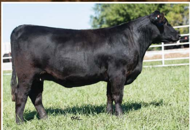
NPC Chloe C515