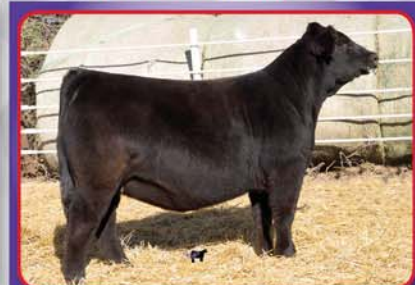
LHT Ms Uprising 136D LLSF Uprising Z925 x Remington Red Label HR • February PB Show Heifer

Catalog online at www.ebersale.com • Bid online at www.LiveAuctions.tv