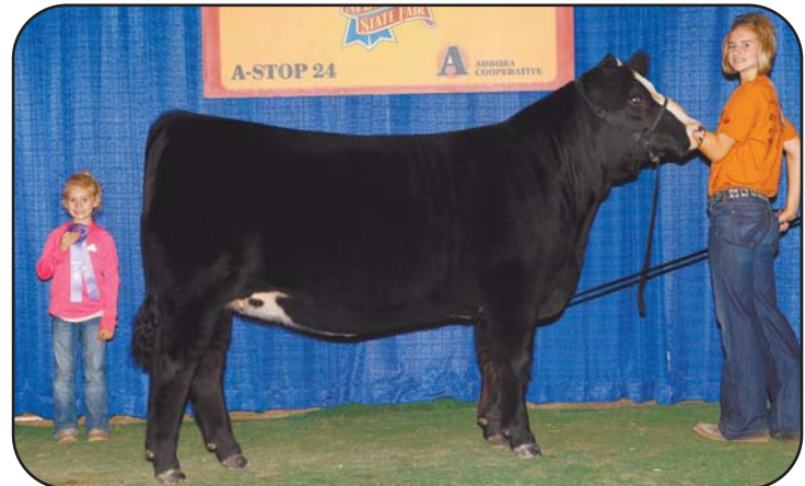
Grand Champion FFA Simmental Percentage Female 2016 Nebraska State Fair