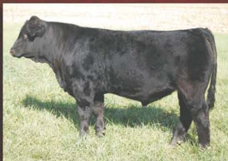
217D • Purebred Driver x Macho