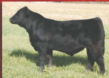
D602 • 3/4 Blood Innocent Man x CNN Lucky Girl 2016 IA State Fair 2nd in Class