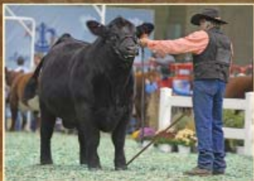
BF Billy Joel

Semen available on WC/BF Innocent Man from: BF Black Simmentals - Cattle Visions - Vogler Semen Center