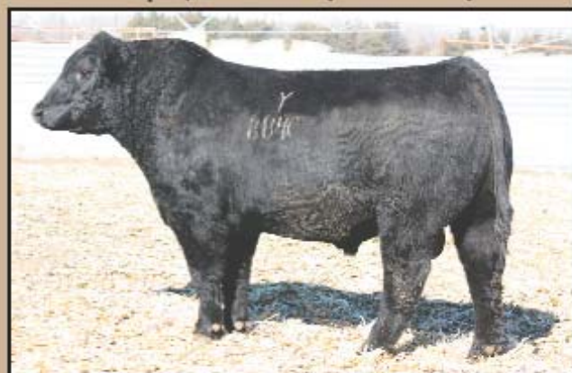
Lot 39 | By Up North — SimAngus™