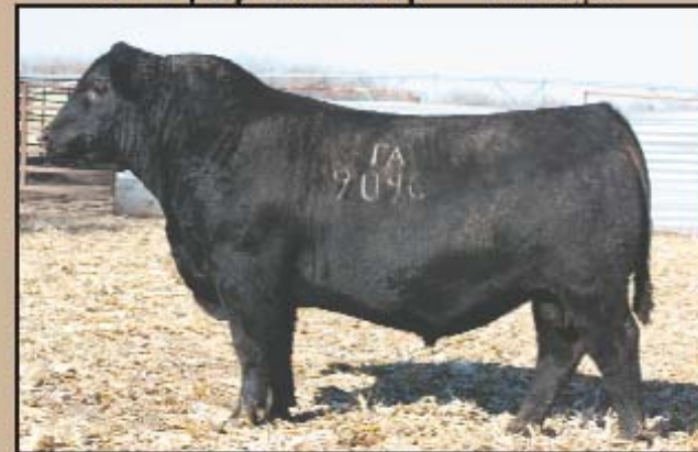
Lot 25 | By Barstow Cash — SimAngus™