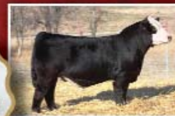
W/C Loaded Up

Here is an opportunity to purchase Steel Force x W/C Loaded Up embryos!