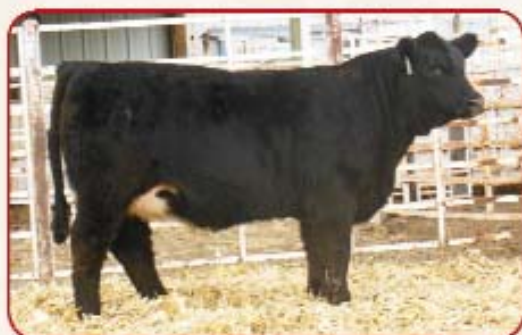
FF MS COWBOY D1070