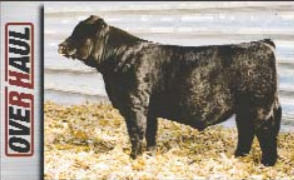
D612 • Purebred Jack Around x T85 2016 IA State Fair Res. Champion