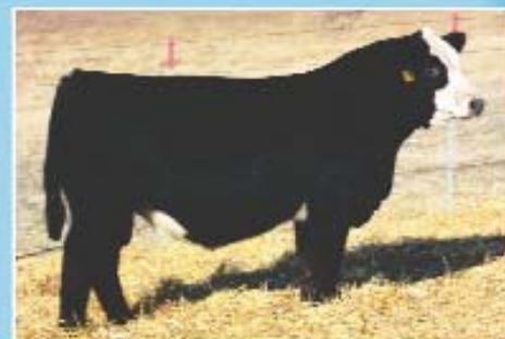
W/C LOCK DOWN

Be sure to watch for our Pen of Bulls in Denver!