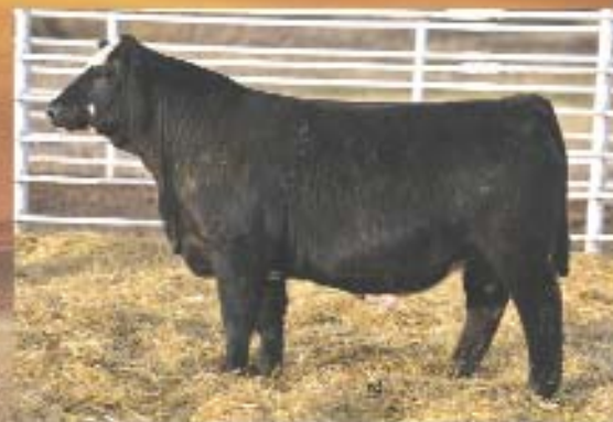
5510 REMINGTON LOCK N LOAD 54U x TJ 44Y • One of seven Full Sibs Selling.