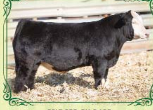
FELT FED EX 345D Sired by B C Lookout 7024 PB Simmental • BW 79 • 822

Thursday, February 16th 12:00 Noon Sale Location: West Point Livestock Auction West Point, NE