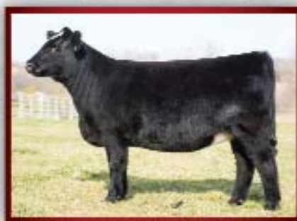
LZF Sid 133D

this fancy purebred bull is loaded with style and performance.