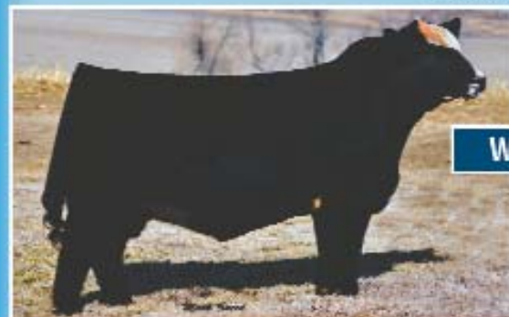
WS STEPPING STONE

$160,000 bull purchased by C-Mor Beef, Blackford Show Cattle, Bar Q H Farms & JS Simmentals