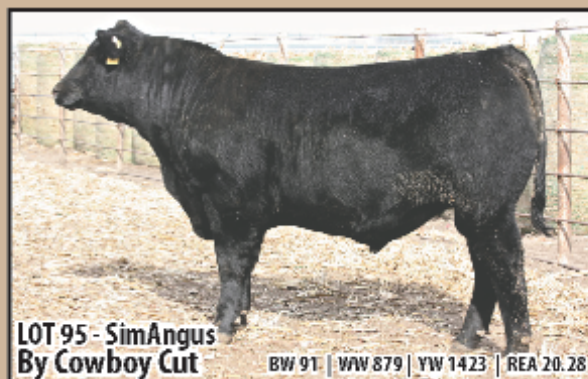
LOT 95 - SimAngus By Cowboy Cut