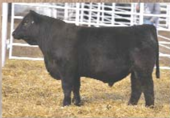
5100 TJ MAKERS MARK 215Y x TJ 8T • Top 2% YW and TI Top 1% API.