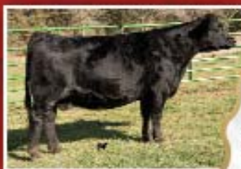
Donor BF Miss Steel Force 83W

Don't Miss THE EMBRYO PACKAGES IN THE SIMMENTAL SALE!