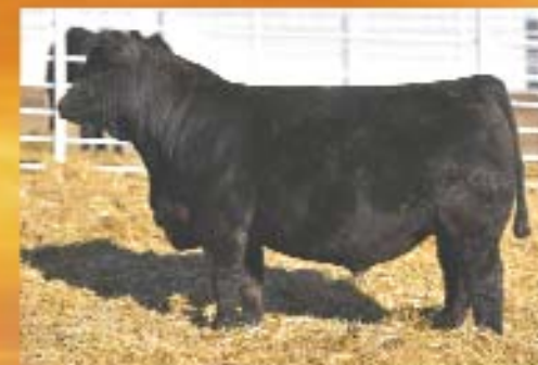
3003D TJ MAKERS MARK 215Y x TJ 36Z • 108 WW Ratio.