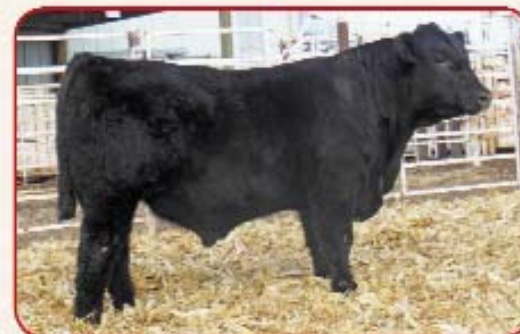
FF GRADUATE ET D956