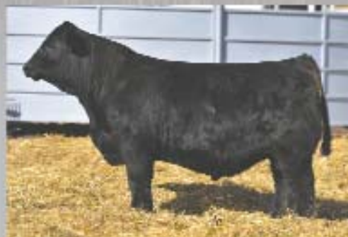
4861D S A V III SOURCE 1441 x MS MISS 3061I • Backed by a proven pedigree.