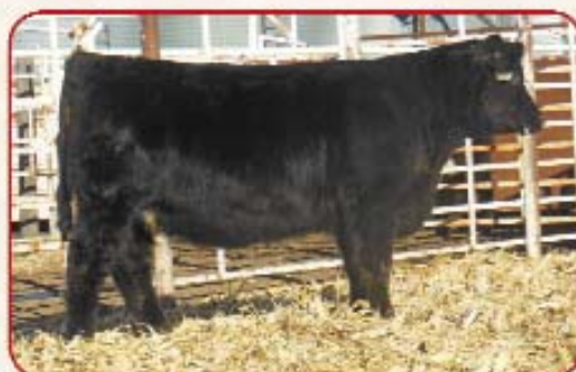
FF MS GRADUATE D1215