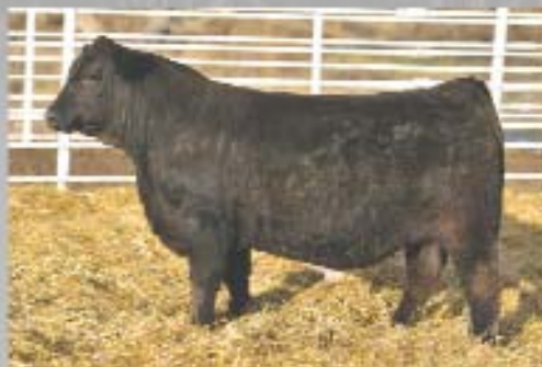
4861D I J COHNUSKI II 226A x I J 15I • Purebred with Top 4% WW & YW.