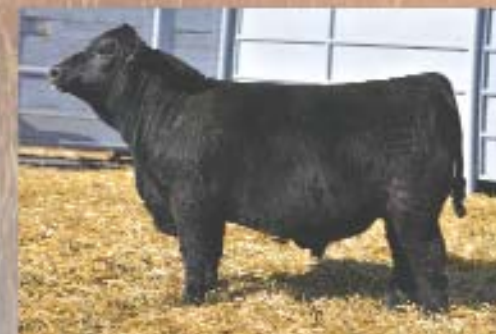
4781D CCR WIDE RANGE 9005A x TJ 21Z • One of four Full Sibs.