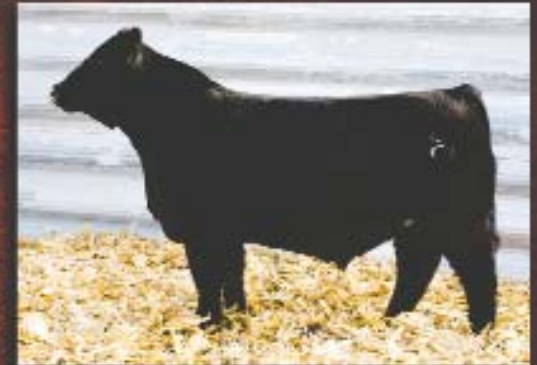
D602 • 3/4 Blood Innocent Man x CNN Lucky Girl 2016 IA State Fair 2nd in Class