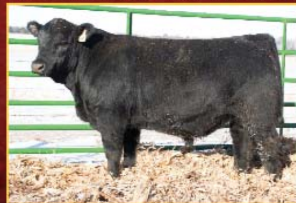
Sandy Acres 1D • ASA 3189444 Sire: Mohnen Long Distance 1639 • Adj. 205: 632 No Creep • Out of a First Calf Heifer • Homo Black