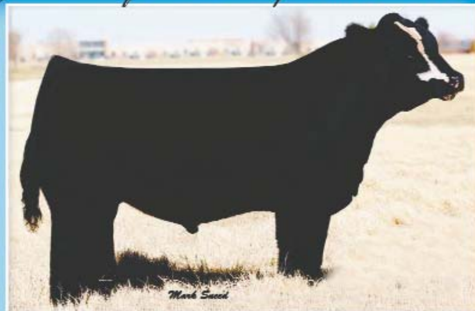
WS A STEP UP X27

$52,000 bull that sold to Yardley Cattle Co. Beaver, Utah