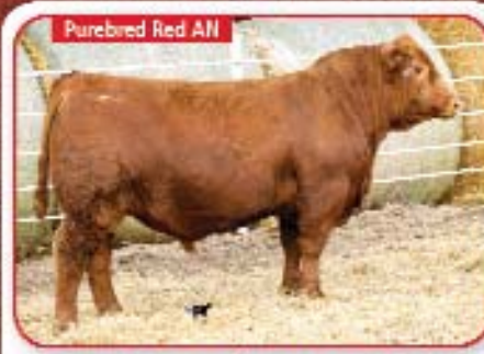
LHT Mr. Redemption 303C

WS Beef King W107 x GCF Amigo BW 1.5 WW 78 YW 110 API 130 TI 80