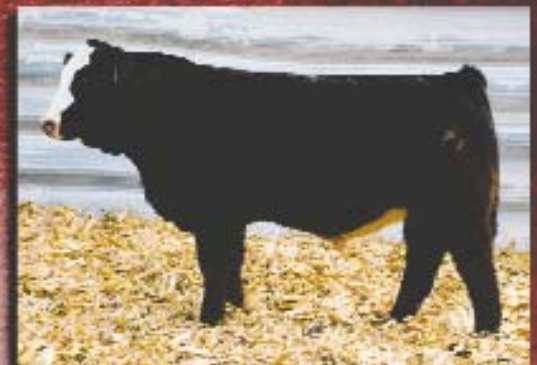
D4 • Purebred Twisted Steel x Hardcore