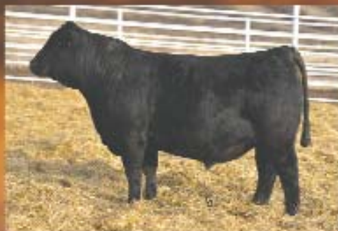
2941D MAR INNOVATION 251 x TJ 33Y • Top 2% CE, Top 1% API and 124 WW Ratio.

Bulls will be performance tested, carcass ultrasound tested, fertility tested and will have all performance information and EPDs available.