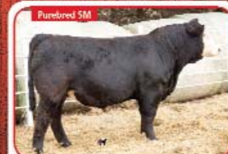
LHT Mr. Lock N Load 348C

Mr NLC Upgrade x CR/DCC Copy Right 6626 BW 1.9 WW 67 YW 89 API 115 TI 69