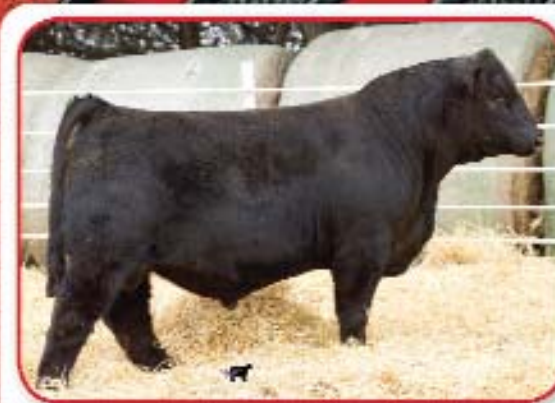
LHT Mr. Upgrade 92D

WS Beef King W107 x PCC Colorado Hobo BW -0.1 WW 67 YW 98 API 150 TI 78