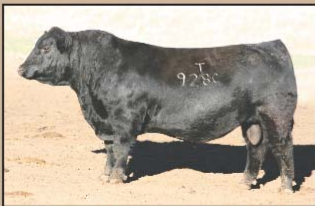
Lot 4 | By Cowboy Cut — SimAngus™