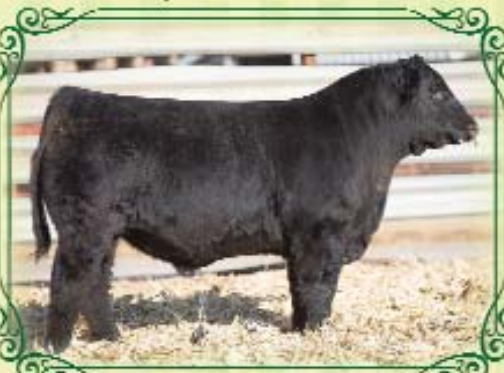
FELT PEDRO 176D Sired by Nelson Style 4418 SimAngus • BW 80 • WW 800