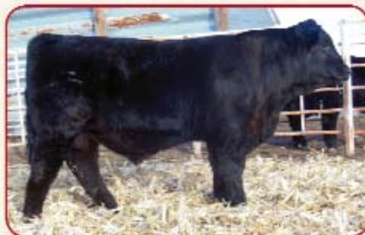
FF GRADUATE ET D882