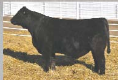
4941D CCR COWBOY CUT 5048Z x I J U14 • One of three Full Sibs - Spread Genetics.