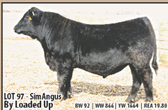
LOT 97 - SimAngus By Loaded Up