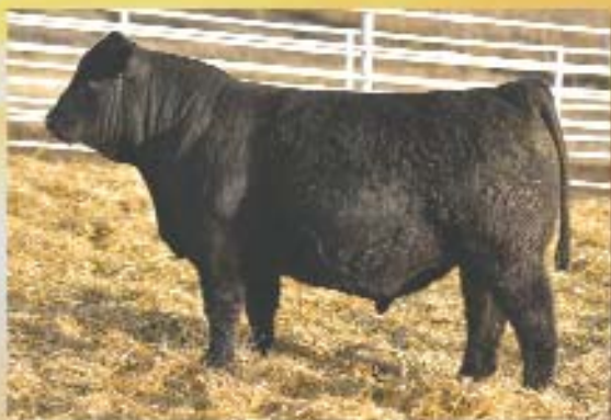
5250 HOOK'S BOZEMAN 8B x TJ MS 7W • One of five Purebred Flushmates.

1:00 PM (CT) • At the Ranch, Miller, NE Selling 175 Simmental, SimAngus & Angus Bulls