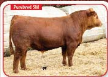
LHT Mr. Beef King 313C

W/C Executive Order x LHT Star Struck 112W BW -1.0 WW 62 YW 97 API 137 TI 75