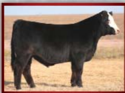
Mr Bandwagon D6

THE CLASSIC SALE FEATURES BULLS, BRED HEIFERS, FANCY OPEN HEIFERS & EMBRYO PACKAGES.