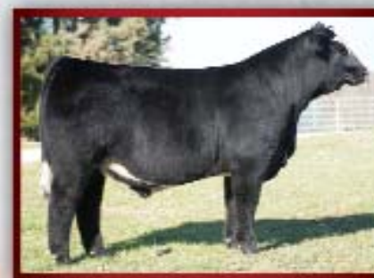
Mr SB Disclosure 36D

a halfblood Chopper daughter that has unlimited potential!