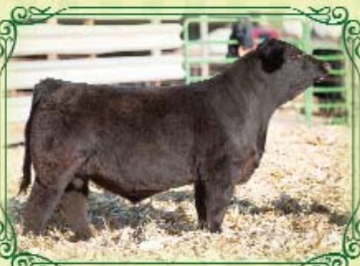
FELT TRUMP 318D Sired by Nelson Style 4418 SimAngus • BW 80 • WW 804

Guest Breeders: Roberts Simmental 402-369-1002 & Volk Livestock 402-922-9997