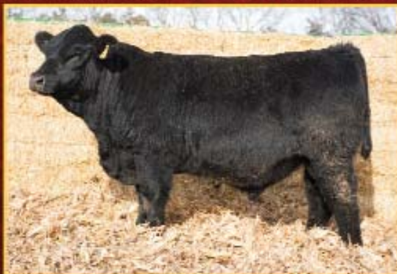
Sandy Acres 11D • ASA 3189514 Sire: LLSF Pays To Believe ZU194 • Adj. 205: 807 No creep • Homo Black