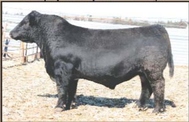
Lot 18 | By Loaded Up — SimAngus™