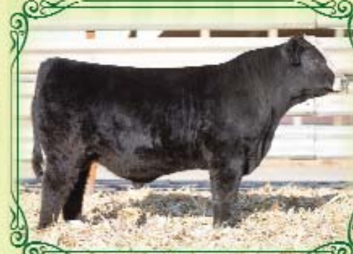
FELT SWEET BABY NICK 702D Sired by Harkers Johnny Ringo SimAngus • BW 80 • WW 863