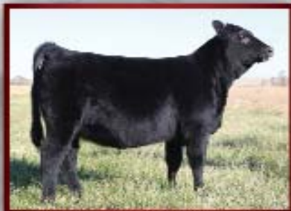
Jenny of Rancher

This bull was the 2016 American Royal PTP Show Res. Champ Percentage Bull Calf. He is sired by Mr Hoc Broker.