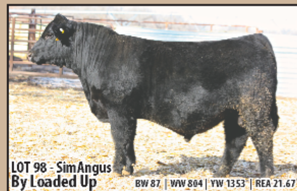
LOT 98 - SimAngus By Loaded Up