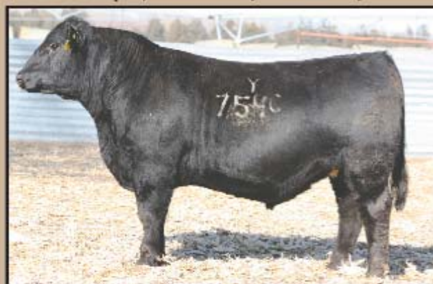
Lot 75 | By Loaded Up — SimAngus™