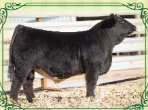
FELT BIG BEN 6D Sired by Harkers Johnny Ringo SimAngus • BW 80 • WW 794