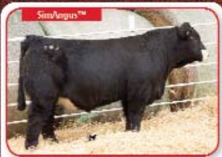
LHT Mr. Executive 99D

Remington Lock N Load x HC Hummer 12M BW 1.8 WW 57 YW 99 API 114 TI 66