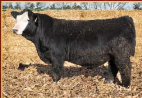
Sandy Acres 5D • ASA 3189456 • Full Sib to Vision Adj. 205: 690 • No Creep • Homo Black/Homo Polled