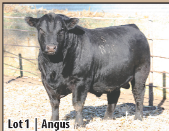
Lot 1 | Angus

THREE ET BROTHERS SELL! - Connealy Capitalist x G A R New Design 5050