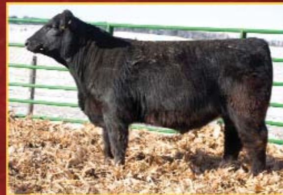
Sandy Acres 12D • ASA 3189526 • 3/8 SM 5/8 AN Sire: J&C Black Maximizer W5 • Adj. 205: 686 • No Creep