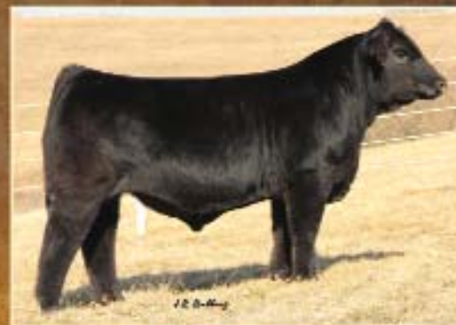
SC Pay In Cash

Sire: Mr. TR Hammer Dam: Longs Foxy Lady