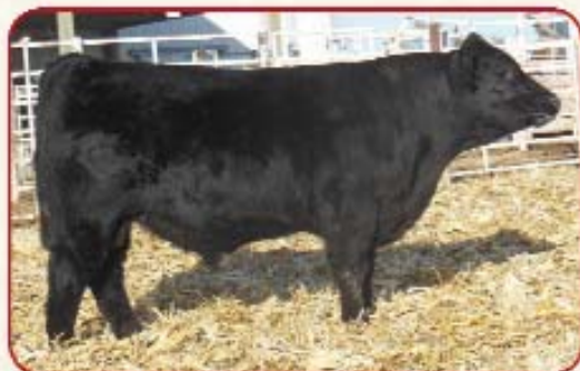
FF GRADUATE D714

50 Bred Females (Bred to Top Calving Ease Bulls) • 25 Fancy Open Heifers