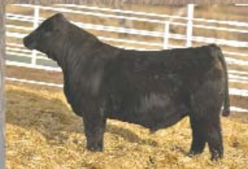
4511D CCR COWBOY CUT 5048Z x TJ U11 • 116 WW Ratio - Top 3% TI.