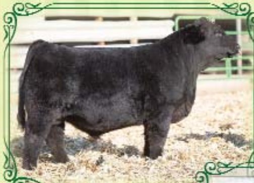
FELT CANDY MAN 41D Sired by Harkers Johnny Ringo SimAngus • BW 86 • WW 868