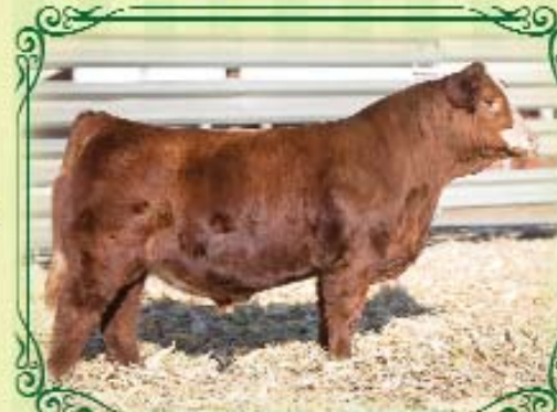
FELT RED EAGLE 772D Sired by HPF Dominance Y827 PB Simmental • BW 83 • 883