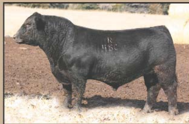
Lot 14 | By Loaded Up — SimAngus™