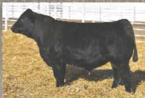
4011D S D S GRADUATE 006X x TJ 7B • Top 1% BW, Top 3% API.