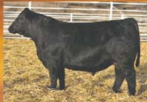
2971D CONNEALY COMRADE 1385 x TJ 34X • Top 1% CE, BW, API.