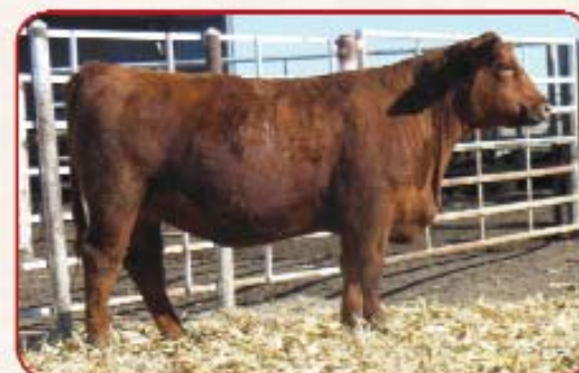
FF MS REDESTINED C1262