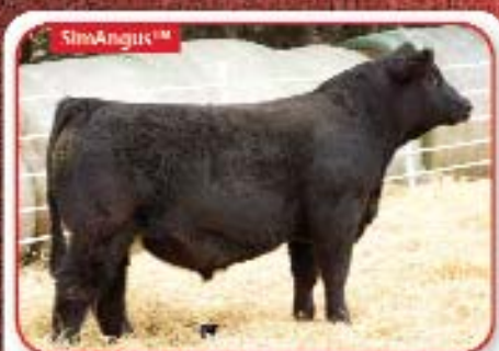
LHT Mr. United 87D

W/C United 956Y x WLE Power Stroke BW 1.5 WW 75 YW 174 API 144 TI 80