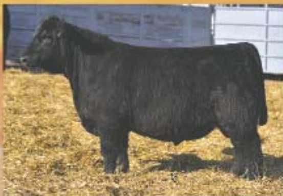
5450 HOOK'S BOZEMAN 8B x TJ U19 • One of ten Hook's Bozeman 8B sons to sell.