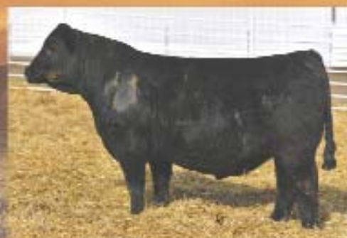
3471D CCR COWBOY CUT 5048Z x TJ 43Z • Top 1% WW & TI - 124 WW Ratio.