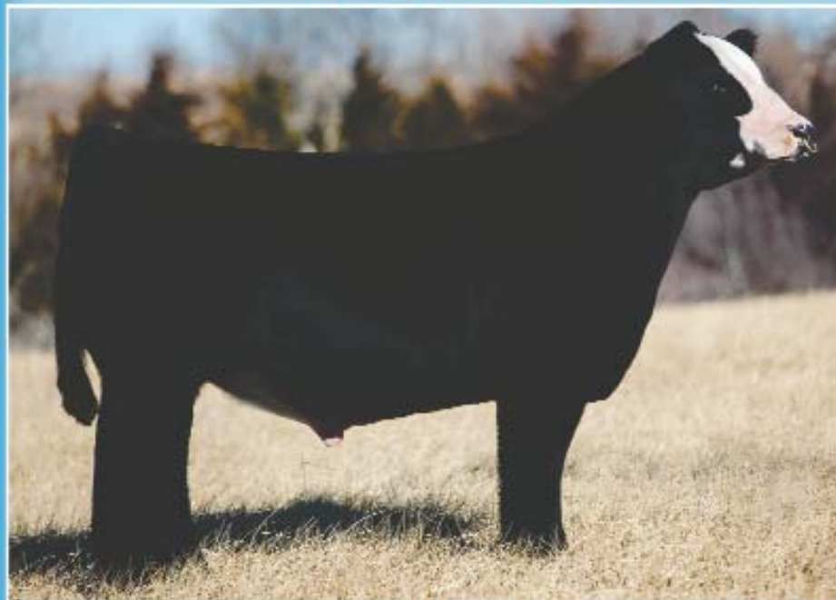
WS REVIVAL B26

$160,000 bull purchased by C-Mor Beef, Blackford Show Cattle, Bar Q H Farms & JS Simmentals