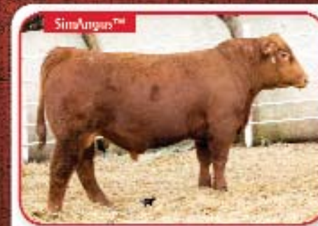
LHT Mr. Beef King 336C

Brown JYJ Redemption Y1334 x PCC Colorado Hobo BW -3.4 WW 57 YW 99 API 128 TI 68