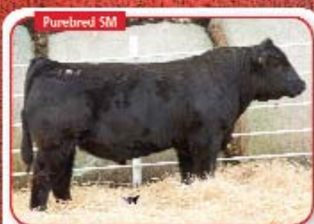
LHT Dream Order 03D

W/C United 956Y x WLE Power Stroke BW 1.5 WW 75 YW 174 API 144 TI 80