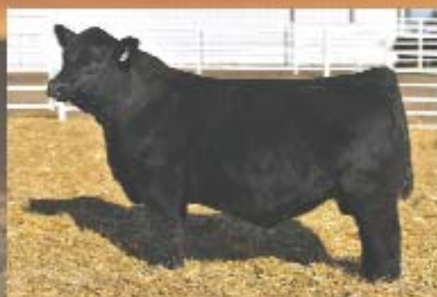
3271D TJ SHARPER IMAGE 809U x TJ 18Y • Top 5% YW.