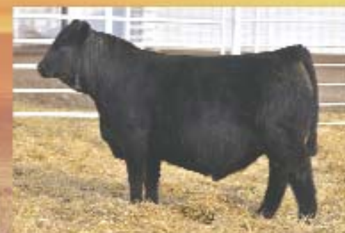
3888D PVF INSIGHT 0129 x TJ 6U • 117 WW Ratio.