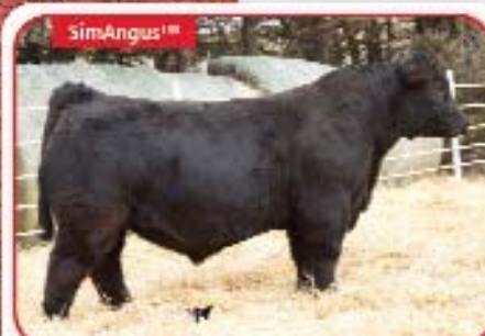
LHT Right Grade 32D

W/C Executive Order x WWS Antoinette 228 BW -0.7 WW 73 YW 113 API 142 TI 81