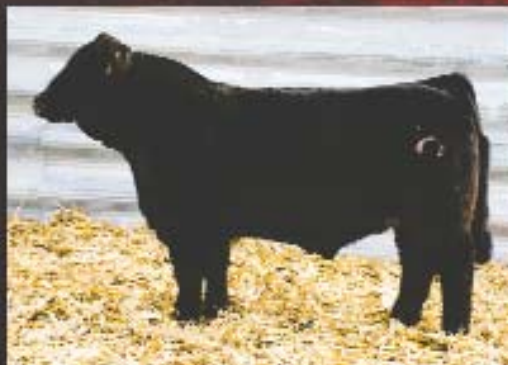
D869 • 3/4 Blood Innocent Man x JS Sure Bet