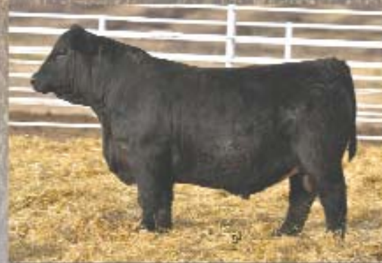
5120 TJ MAKERS MARK 215Y x TJ 8T • Full sib to 5100, Big Time Figures!!

FEATURED SIRES INCLUDE: TJ Main Event • TJ Cornhusker • CCR Cowboy Cut • TJ Cowboy Up • TJ Makers Mark • TJ Sharper Image • TJ Z54 Maverick