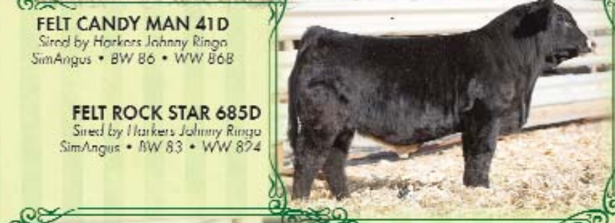
FELT ROCK STAR 685D Sired by Harkers Johnny Ringo SimAngus • BW 83 • WW 824