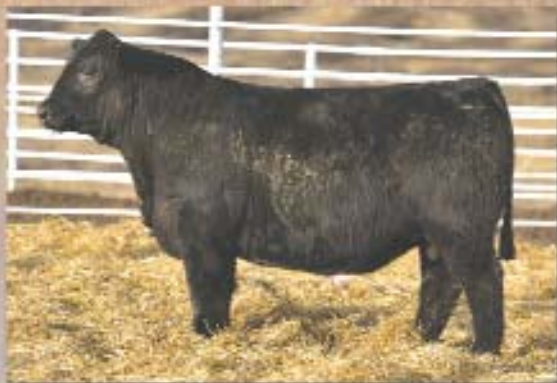
5550 CCR COWBOY CUT 5048Z x TJ 16Z • 3/4 with 158+ API.