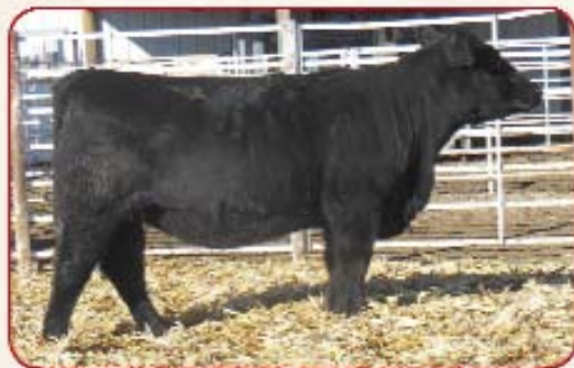
FF MS PARAMOUNT C1390

SIRES: GW REDESTINED X SLGN SAM BRED TO FF BRILLIANCE C1310