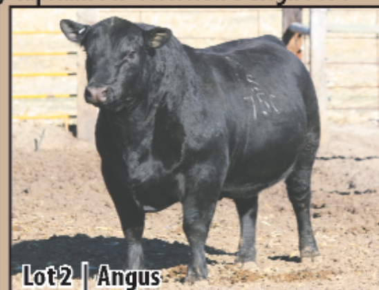
Lot 2 | Angus

Selling 72 'Super Stout' Two-Year-Olds, 21 'Powerful' Fall Yearlings and 19 'Dynamic' Yearlings!