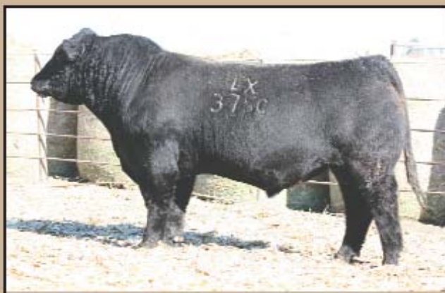
Lot 13 | By Loaded Up — SimAngus™