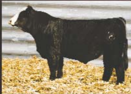
D604 • Purebred STF Royal Affair x T85 Ms Fancy Yardley