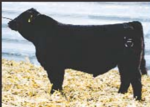
D606 • Purebred Broker x Bernadette 2016 IA State Fair Class Winner