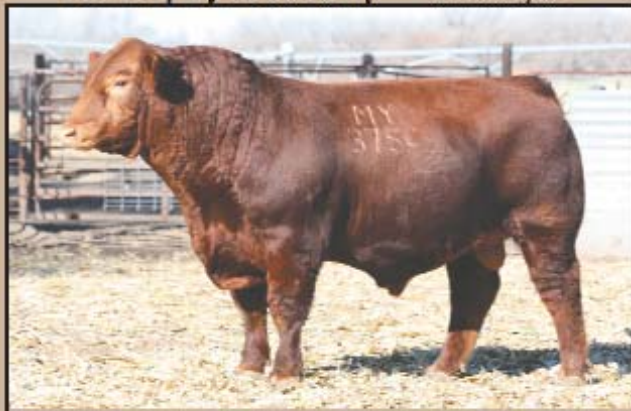
Lot 22 | By Loaded Up — SimAngus™